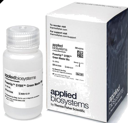
PowerUp™ SYBR™ Green Master Mix